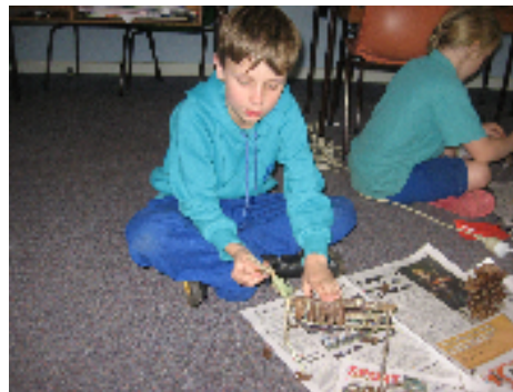
Senior students in Science