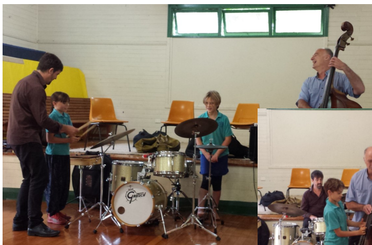
Students performing at Musica Viva