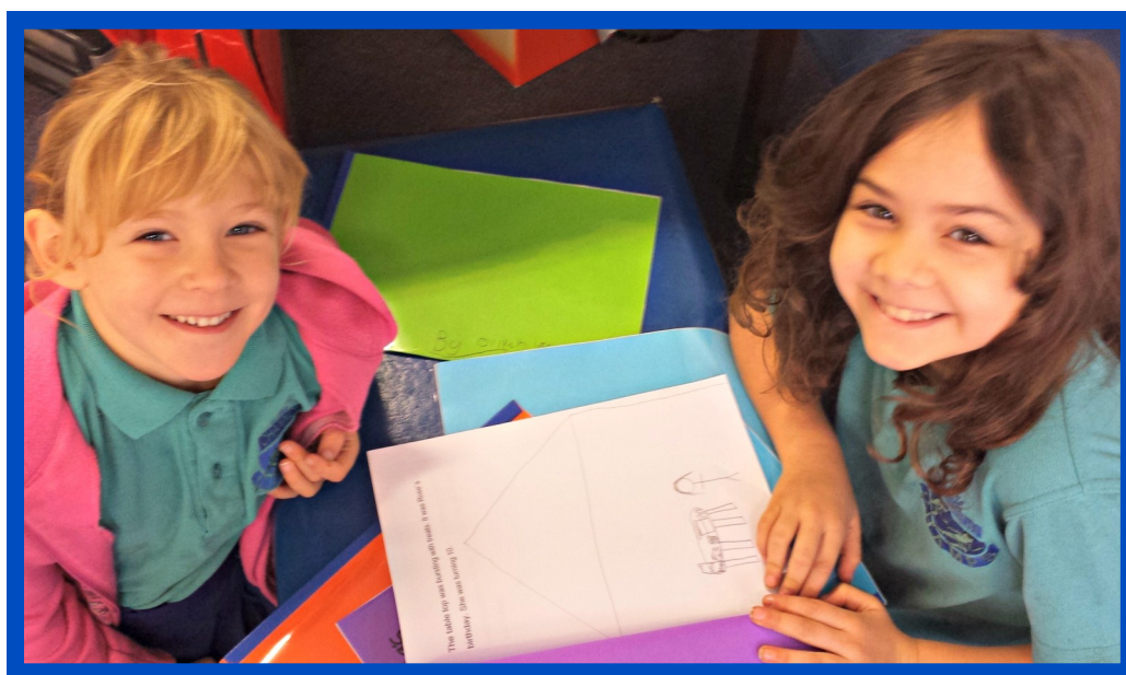
Audrey sharing with Bella the narrative books 2/3's have made.