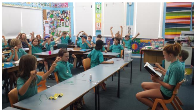
Exploring the element of tension during Drama!

The bus will return to school by 3pm. Please fill in the permission note attached to this newsletter and return it to school with the money by Friday, 4 March, 2016.