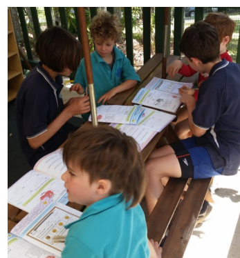
Peer support is held every Monday afternoon